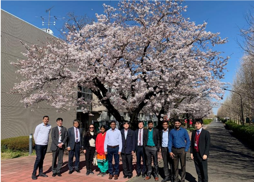
RESEARCH MEETING AT NIHON UNIVERSITY (APRIL 2019)