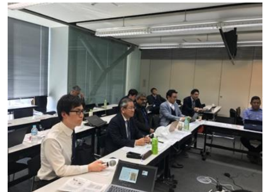
JCC meeting in Nihon University

Welcomed by the fully bloomed cherry blossoms in the campus, it was a good opportunity for each group's researchers to discuss directly their research progress.