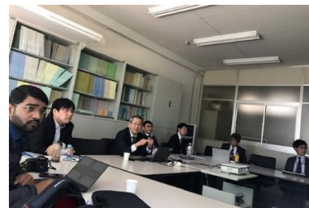
Meeting in Nihon University

Lastly, the researchers were divided into the 4 groups to have focused discussions and chalk out next steps. Through the face to face discussions, the relationship of trust between researchers became strong, and it became a very meaningful meeting.